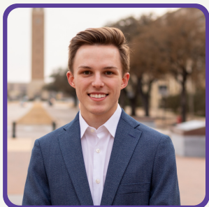
Chair & Board of Directors Member