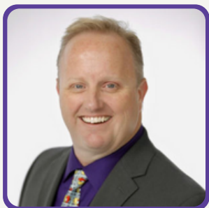
Senior Vice President, Global Mission, State Development and Operations

"The YLC was created to showcase the incredible diverse young leaders that volunteer their time and talent to help make the Best Buddies mission come to life. We are truly fortunate to have them."