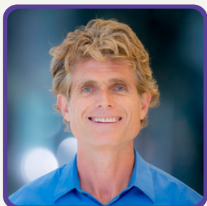
Founder, Chairman & CEO

"Without question, one of the most fulfilling and validating parts of my role at BBI is having the opportunity to serve as a guide, support, and liaison for the YLC. This truly outstanding group of young leaders inspires me every single day."